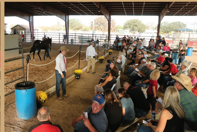
Thank You to all that come out and supported the sale!