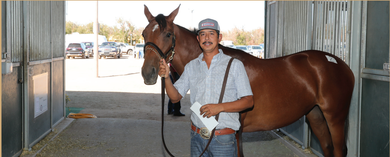
Headed for the sale ring