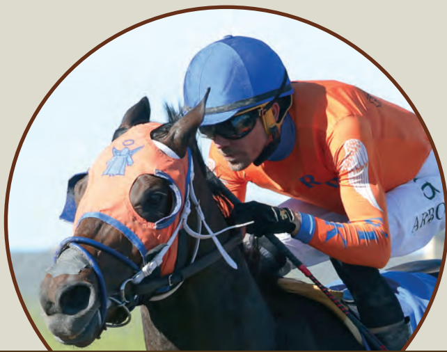
2018 Champion Arizona-Bred Three Year Old Colt/Gelding Fortified Effort