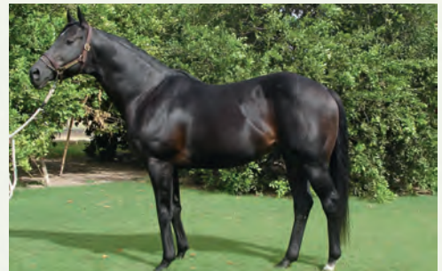
Rocky Bar In Excess (IRE) - To the Post by Bold Ego

Total earnings of his progeny in 2018 was $517,205