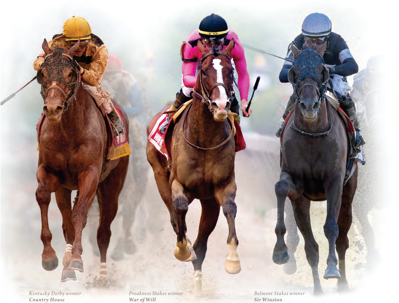
Kentucky Derby winner Country House