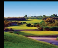
TWO 18-HOLE CHAMPIONSHIP GOLF COURSES