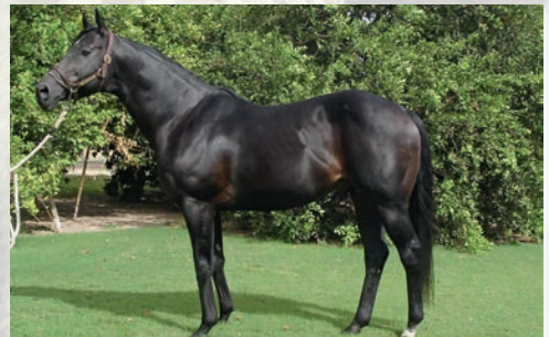
In Excess (IRE) - To the Post

Total earnings of his progeny in 2017 was $753,575