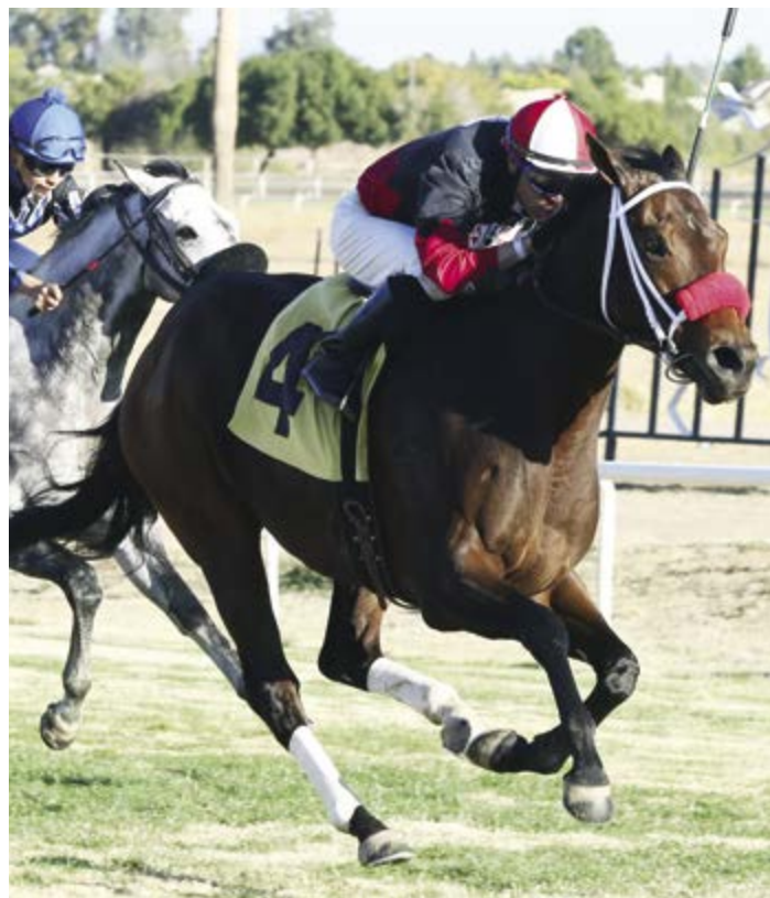
Storm Power winning the Walter Cluer Memorial.