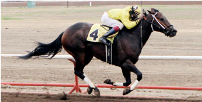
BREEDERS' CUP FILLY & MARE SPRINT STAKES LETHBRIDGE, ALBERTA, CANADA

FRESHSIDE (Dbb, Mare, foaled 2008, 122 lbs.)