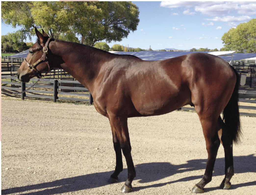
Hip number 43, bay colt by Haynesfield / Company Storm sold for $62,000.