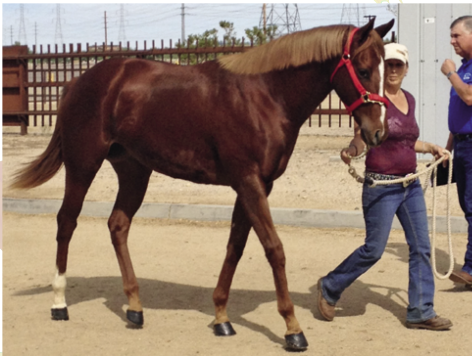
Hip Number 78, Chestnut Filly by City Zip out of Shop for Gold Consigned by Fleming Thoroughbred Farm, LLC

H & E Ranch also sold Hip# 29, a chestnut colt by Orientate out of Autumn Wedding. He was purchased by