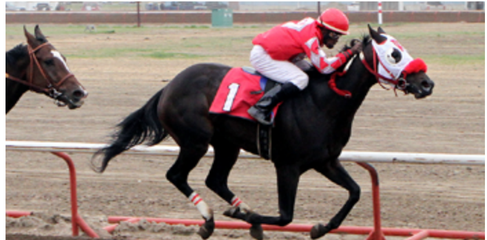
BREEDERS' CUP THREE-YEAR OLD STAKES LETHBRIDGE, ALBERTA, CANADA

SHOOTITINTHEBUSH (Dbb, Gelding, foaled 2011, 120 lb)