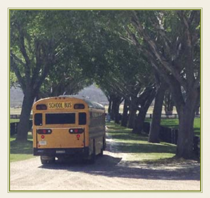
At the end of the day the buses loaded up the children and returned them to school.