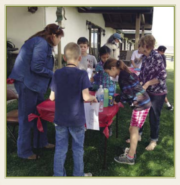
The craft center is where the kids created bandanas and beaded book markers.