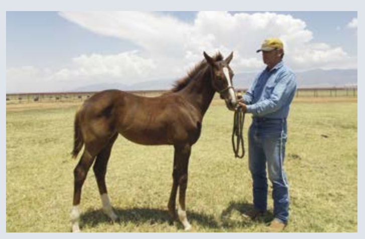
Weanling "Running For Annie" growing up at the Flemings Thoroughbred Farm in Willcox, Arizona.

Additionally, she very much wants to return by October so she can give "Running for Annie" some peppermints at the sale to be held a West World in Scottsdale, Arizona.