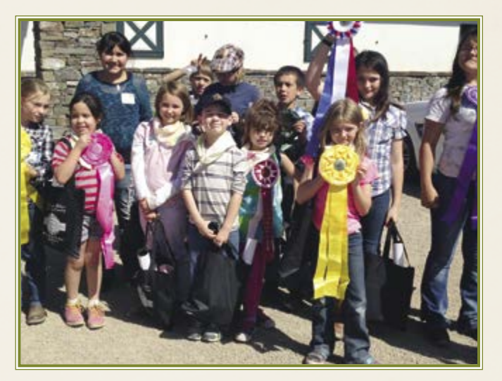
The children proudly display their colorful horse show ribbons that were inside their individual goodie bags.