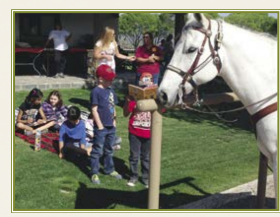
Kids practicing their reading skills.

Hidden Springs Ranch is always in immaculate condition from it's lush green pastures to perfectly manicured shed row's. The modern stable office is a wonderful setting for any top executive to be proud of and you couldn't ask for a better view from the conference table. Outside the office