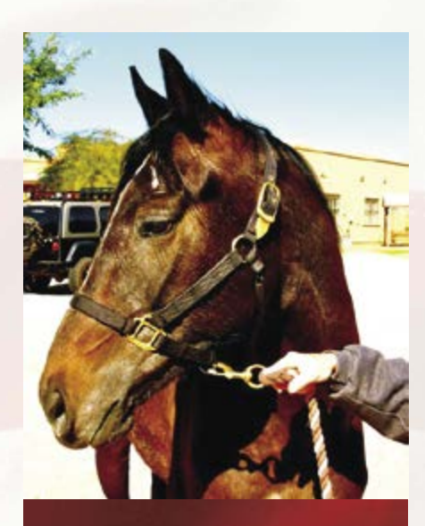
Devgru's life has been surrounded by military connections. It is fitting he now services as a therapy horse for veterans and first responders.