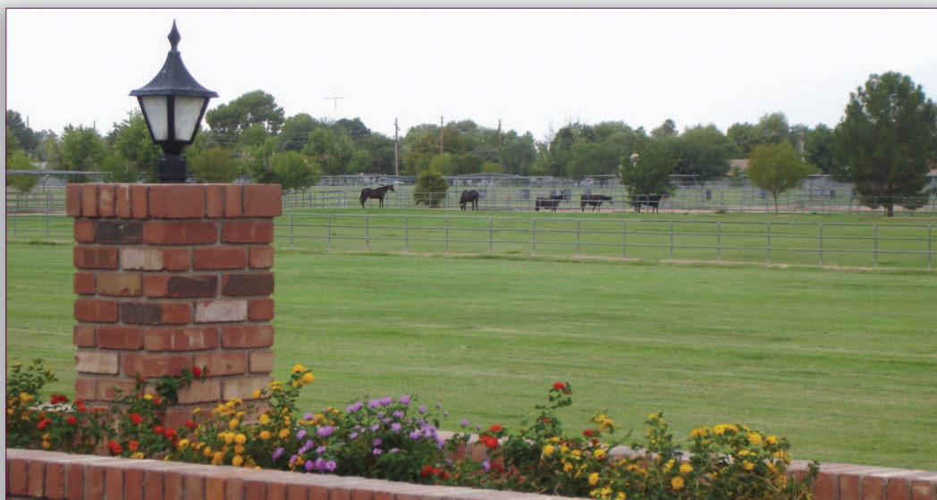
Strong family ties are a cornerstone of Triple AAA Ranch in Glendale, Arizona