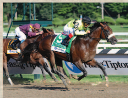
G2 Winner A LITTLE WARM