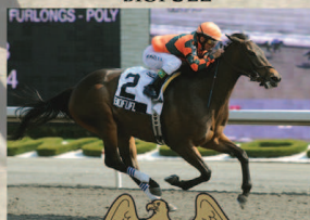
Champion & Horse of the Year BIOFUEL