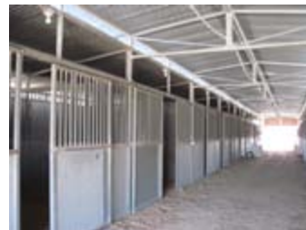
Barn (20 stalls)

This is a traditional sale (not bank owned or short sale) Contact Realtors for all information.