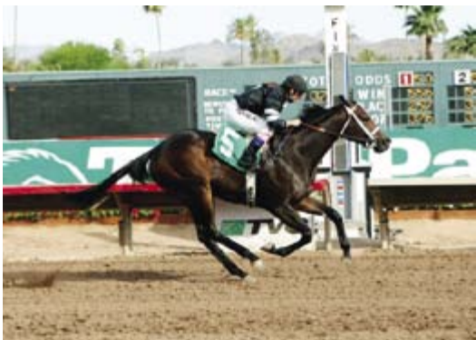
PAGE SPRINGS – ATBA Sales Stakes – Turf Paradise Purse - $55,000.00 May 8, 2011