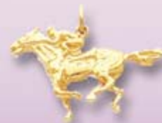
ER723/SS Horses & Jockey Charm